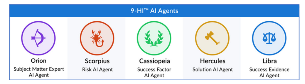
No Hallucination concerns. No IP leakage back to public GPT models. No Risks that cannot be modelled.